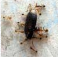
insect prey - image

The BHA is omnivorous, feeding on sweet liquids such as honeydews, dead insects, and soil invertebrates. Foragers will quickly recruit nest mates to a food source. Foraging tunnels having numerous entrances can be seen along the soil surface. Arthropod prey are dissected by workers and brought back to the nest.