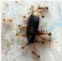
insect prey - video

Trails of foragers can often be observed along trees trunks, sometimes climbing into canopies of tall trees. Similar trails might be seen on the exterior walls of structures as ants climb into attics or other natural or artificial voids.