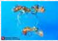
Pharaoh and thief bodies

Pharaoh ants may be confused with thief ants, bigheaded ants, fire ants and several other species of small pale ants. However, thief ants have just 10 segments in their antennae with only a 2-segmented club. Bigheaded and fire ants have a pair of spines on the thorax, while other small pale ants have only a one segment on the pedicel (Smith and Whitman 1992).