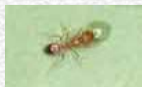
worker - dorsal view

The ant, Monomorium pharaonis (Linnaeus), is commonly known as the Pharaoh ant. The name possibly arises from the mistaken tradition that it was one of the plagues of ancient Egypt (Peacock et al. 1950). This ant is distributed worldwide, is one of the more common household ants, and carries the dubious distinction of being the most difficult household ant to control.