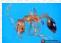
worker - lateral view