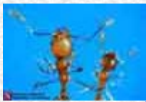
Pharaoh and thief heads