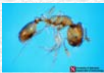
thief ant worker